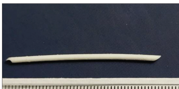
Figure 3. Part of Hickman catheter 4.5 cm long

for the next five days. The child was afebrile and hemodynamically stable. On the third postoperative day, he was extubated, and oral intake was started. Postoperative laboratory results on discharge were normal, and the child was transferred to the hematologic ward for further treatment.