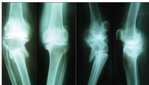
Figure 1. X-rays of both knees in a patient with a proximal metaphysis stress fracture of the right tibia, associated with severe bilateral knee osteoarthritis