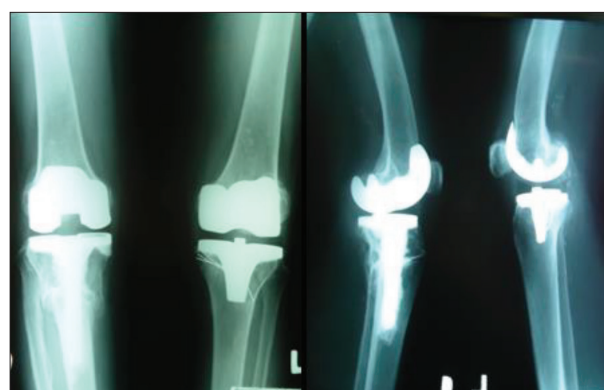
Figure 2. X-rays of both knees in a patient with a proximal metaphysis stress fracture of the right tibia, associated with severe bilateral knee osteoarthritis, treated with bilateral total knee arthroplasty in two acts, nine months after the first modular total knee arthroplasty