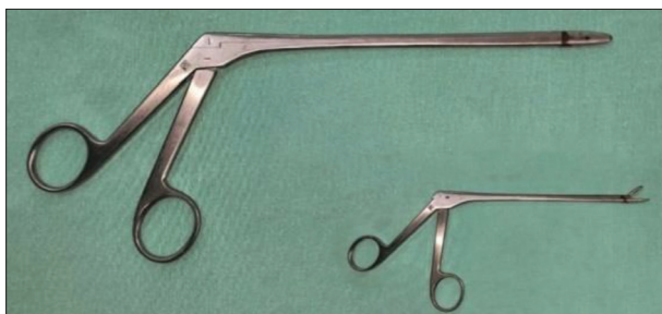
Figure 3. Red line at the tip of the mouth of the straight and reverse-angled rongeur device

in the bladder bag, the drainage fluid was analyzed and confirmed to be urine.