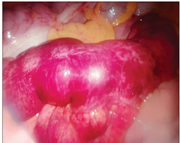
Figure 1. Intraoperative view of the segment of the small intestine that was in the hernial sac

In the case of our patient, a segment of the small intestine was incarcerated, which was found within the hernia sac.