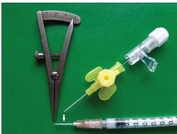
Figure 1. The preparation of small-gauge needles (26G) for suprachoroidal injection