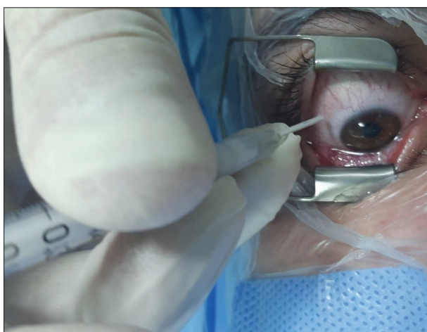
Figure 2. The suprachoroidal space application of 10 mg / 0.1 ml triamcinolone acetonide in the superotemporal quadrant 4 mm from the limbus

diameter of 0.7 mm (B Braun, Melsungen, Germany). This plastic sheath of the branula was cut to an approximate length of 11 mm so that only the tip of the needle up to the bevelled edge was exposed, only 0.9–1 mm. Thus, only the terminal tip of the needle was available for manipulation, which was only long enough to penetrate through the scleral thickness and reach the SPC. All these measurements were performed using a sterile caliper. Figure