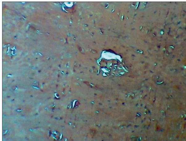
Figure 2. Osteogenesis of compact bone six weeks after the completed low-level laser treatment; 25 ×

its repair capacity may be impaired due to mechanical instability and the presence of other tissues with higher proliferative activity. The use of several techniques, including LLLT, has been studied in order to improve regeneration of alveolar bone and upgrading routine dental rehabilitation [8, 9]. In periodontal, oral, and maxillofacial rehabilitation, application of LLLT for assisting the treatment with bone grafts, distraction osteogenesis, peri-implant tissue healing, and wound healing, becomes an emerging trend, and has shown promising results [9]. It includes wavelengths 500–1100 nm and a dose of 1–4 J/cm 2 , using lasers with output powers of 5–90 mW. The infrared portions of the spectrum have been shown to provide the best therapeutic results [2, 10]. Keklicki et al. [2] noticed that LLLT with