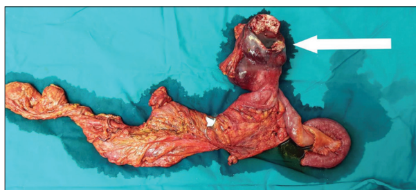
Figure 1. Photograph of the of intraoperative sample; a completely tumor-altered cecum is marked with the arrow

The postoperative period was marked by ventricular fibrillation on the fifth postoperative day. The patient was resuscitated and returned to sinus rhythm using direct current cardioversion shock. The rest of the hospitalization was uneventful and after seven days, the patient was discharged. No evidence of complications was noted during first two follow-ups. The control MSCT of the abdomen and small