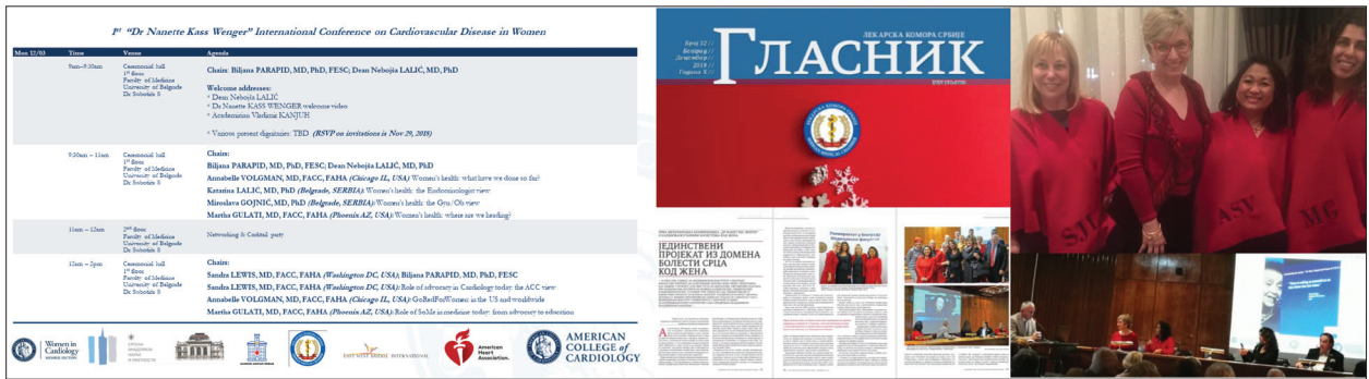
Figure 1. The first “Dr Nanette Kass Wenger” International Conference on CVD in Women (Dec 2018): Program, snapshot of the article dedicated to the event in the Serbian Medical Chamber’s journal “Glasnik” and pictures from the event

particular [36, 37, 38], here proposed Serbian model of a WHC offers also a possible solution to the problem.