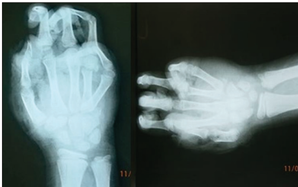
Figure 5. X-Ray of the injured hand