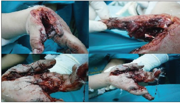
Figure 4. Initial finding of explosive wound in a 10-year-old boy