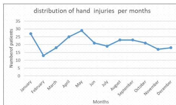
Figure 2. Graph presenting a bimodal distribution of hand injuries per months