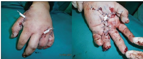
Figure 6. Appearance of the hand after reconstructive surgery was performed

and proximal phalanges two). Partial amputation of two fingers was present in six, and of three fingers in two patients. Fingertip partial amputations were caused by door slamming in 20 younger children, and in 15 were caused by different tools and machine handling among older children.