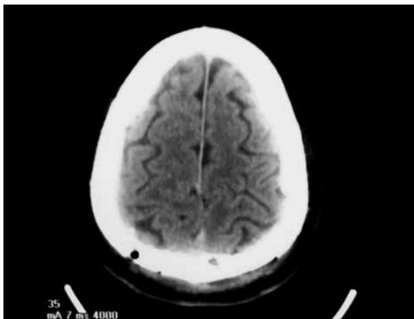
Figure 3. Postoperative CT of the brain. No residual tumor was found.

part of polysystemic enchondromatosis (Ollier's disease) or multiple enchondromatosis associated with soft tissue angiomas (Maffucci syndrome) [20]. The first case of intracranial chondroma was reported in 1851 by Hirschfeld [2] and the first surgical resection was reported in 1982 by Nixon [3]. Since then 127 cases of intracranial chondromas were reported occurring at the base of the skull and originating from spheno-petrosal, spheno-occipital and